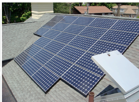
Figure 2: Photovoltaic panels on the Grand Street Firehouse

Watch the daily solar electric output of the panels on the roof of Croton's Grand Street Firehouse: http://bit.ly/Croton_Firehouse_SolarPanels (photos courtesy of Tex Dinkler and Dan O'Connor)]