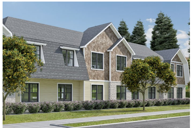
An architectural rendering of the 41-51 Maple Street project from Regan Development Corporation.

ship and Community Protection Act, as well as the standards set forth in the NYStretch Energy Code, which was adopted by the Village of Croton-on-Hudson Board of Trustees in June of 2022. More information about the project is available on the Village website under 'Projects and Initiatives—Archive'.