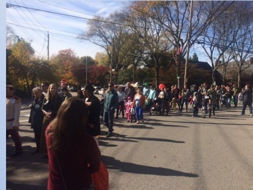
Goblin Walk – October 2019