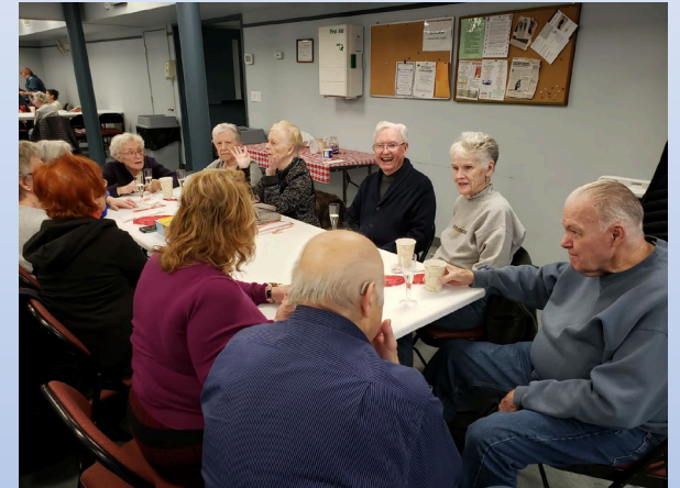
Croton Senior Club Members