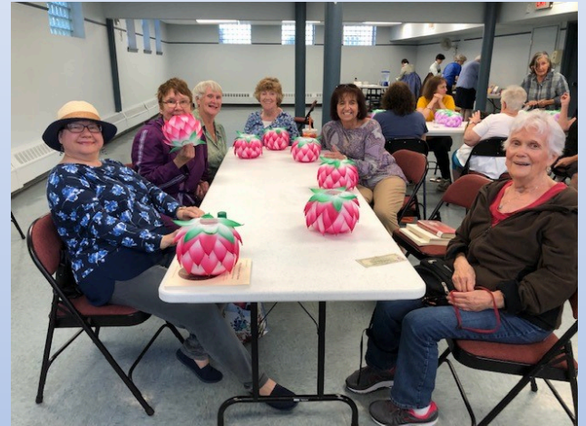
Seniors making lotus lanterns in a class.