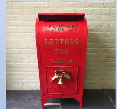
Santa's Mailbox at the Municipal Building