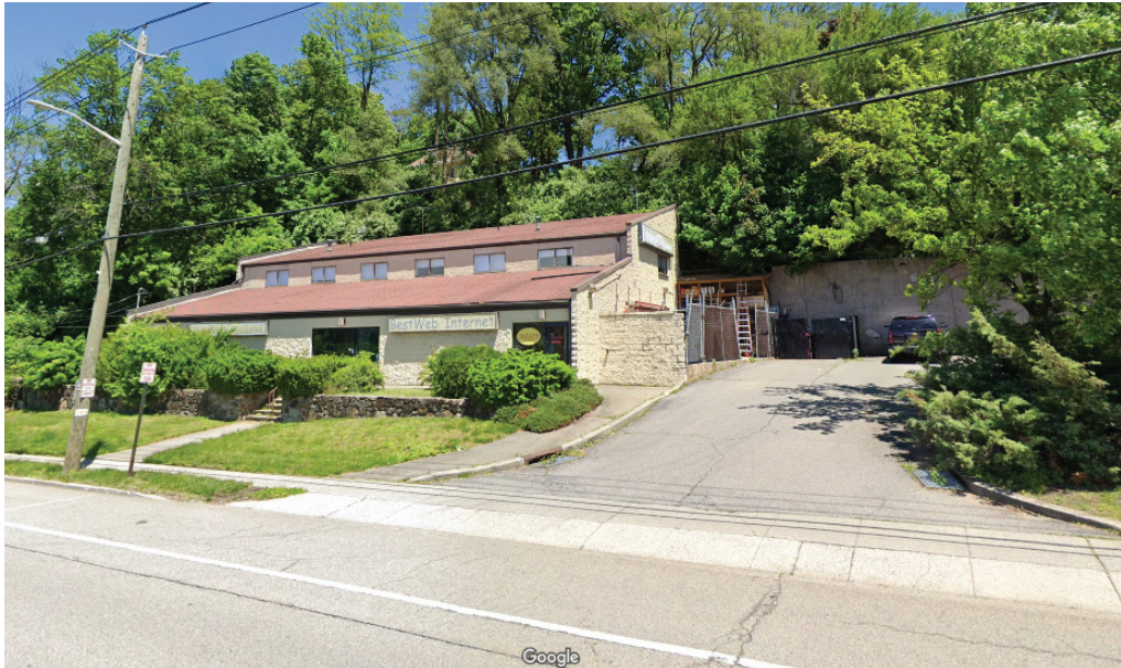
Street view (25 S. Riverside Avenue)