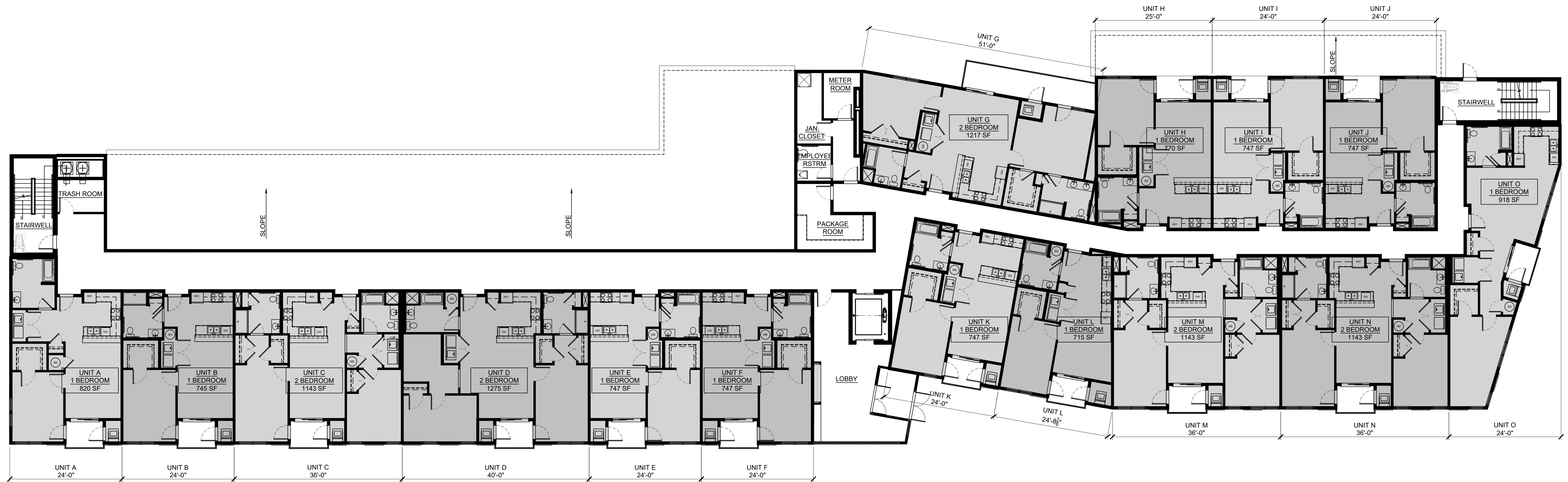
1 FIRST FLOOR PLAN 3/32"=1'-0"

IT IS A VIOLATION OF NEW YORK STATE EDUCATION LAW FOR ANY PERSONS TO ALTER THESE PLANS, SPECIFICATIONS, OR REPORTS IN ANY WAY, UNLESS ACTING UNDER THE DIRECTION OF A LICENSED PROFESSIONAL ENGINEER OR LAND SURVEYOR.