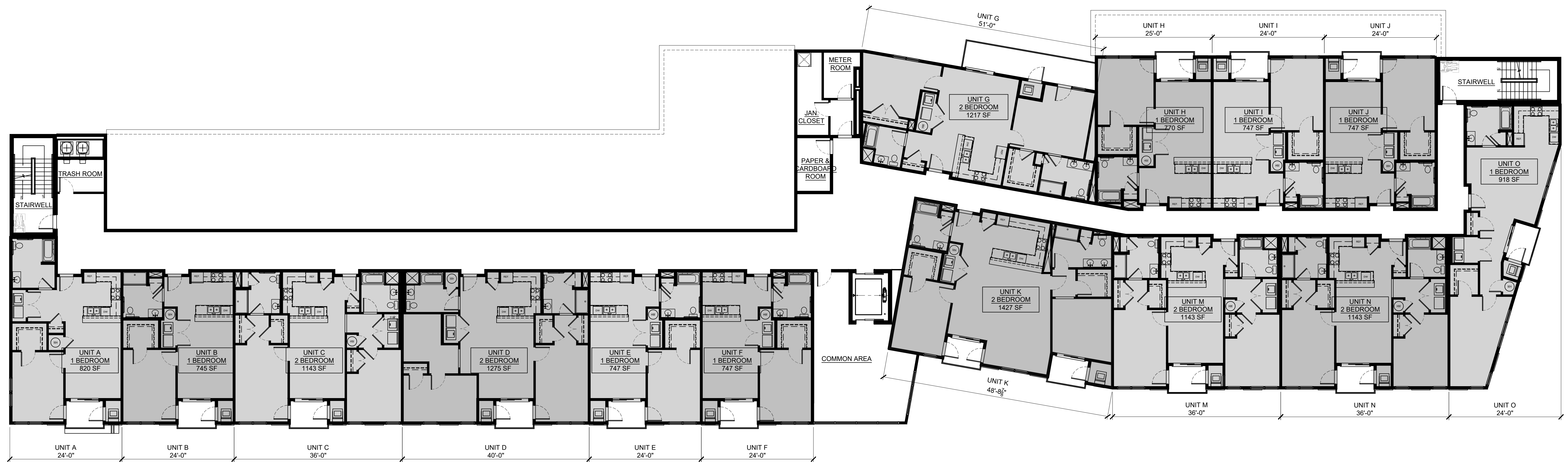
1 THIRD FLOOR PLAN 3/32"=1'-0"

IT IS A VIOLATION OF NEW YORK STATE EDUCATION LAW FOR ANY PERSONS TO ALTER THESE PLANS, SPECIFICATIONS, OR REPORTS IN ANY WAY, UNLESS ACTING UNDER THE DIRECTION OF A LICENSED PROFESSIONAL ENGINEER OR LAND SURVEYOR.