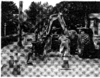
Water line trench on Penfield

The Harmon water line replacement program begun in June this year is moving ahead on schedule or even a little ahead of schedule. The contractor, Bilotta Construction, has laid new lines along Benedict Blvd.