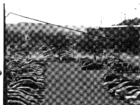
Village-owned Croton-Harmon Parking Lot

Signing up for NuRide is free but does require an email address affiliated with an organization name such as a school or business or government entity. Although it is an ideal way for organizations to promote ride sharing and thereby lessen commute traffic and cleaner air, it is not necessary for the organization itself to sign up. A list of already-registered organizations is available at the website.