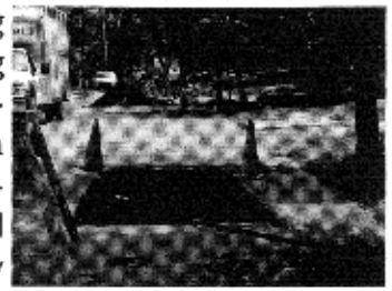
Work in progress on Hastings

and Oneida Ave. and also along the intersecting streets of Young, Hastings and Penfield. Following the laying of the new water lines, connecting to existing water lines will be phased in. This involves a process of "charging" the new lines and chlorination. The pressure testing results and bacteria level results must then be approved by the County Health Dept. prior to connecting to private residences.