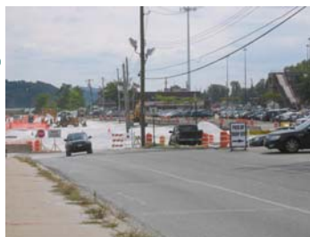
Detours on Veterans Plaza

Initially, new gabion walls were installed along the perimeter of the parking lot border with the Croton River estuary. This required digging out and removal of old fill and soil containing deteriorated wood from the same place. The excavated old fill material was scraped off and stockpiled from the entire work site (mainly Sections G and H). Extensive new drainage systems were installed with features such as hoods in water quality basins and erosion controls. Once the underlying infrastructure for the parking lot was in place, gravel fill was brought in to raise the grade in the work area to an average elevation of 5 feet. Along the way, other aspects had to be dealt with such as raising the light