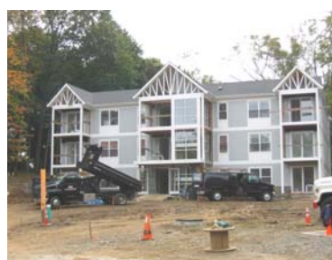
Symphony Knoll Apartments

Arranging financing for the construction was a lengthy process with many sources of funding ultimately involved -