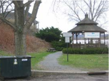
Walkway on Hudson River, south of Elliott Way

be asked to show an ID but you are not required to first stop at the security booth to present it. The hours are 5:30 AM to 9 PM (May I to Oct. 31) and 6