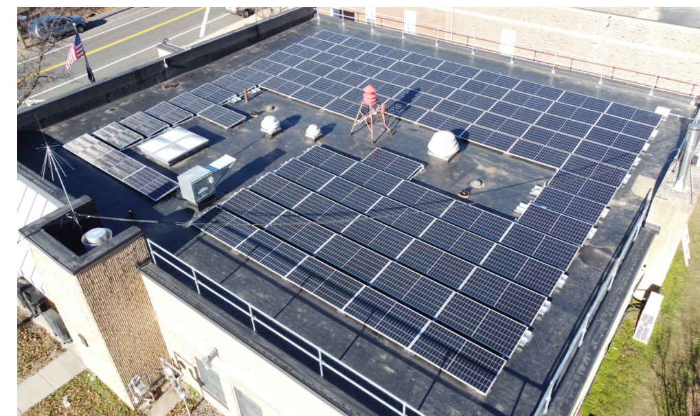
The newly-installed solar array on the Washington Engine Firehouse rooftop.