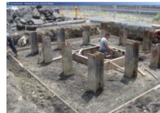
Cell Tower Foundation

A cellular tower is being constructed south of the DPW garage on Veterans Way by Homeland Towers LLC.