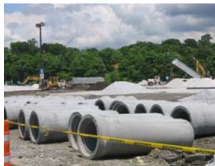
Drainage pipes to be laid

Lake dam, and the sidewalk replacement program.