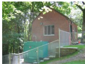
Nordica Pump Station

The new generator at the Nordica sewer pump station will provide reliability during storm outages.