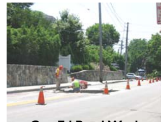
Con Ed Road Work

Route 129/Maple St. between Old Post road South and Olcott. This work consists of some excavation of the road,