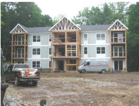
Symphony Knoll Under Construction

A year ago May, ground was broken for the construction of Symphony Knoll, the Croton Housing Networks eleven-unit affordable housing for Seniors. Oc-