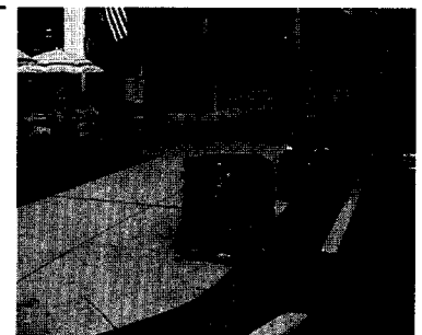
In front of Tricia's Kitchen

jects. These were fired and glazed in many colors, arranged into their final design and grouted together. The Village DPW then helped in cementing the ceramic panels to the six sides of the trash receptacles in time for unveiling at Summerfest on June 1.