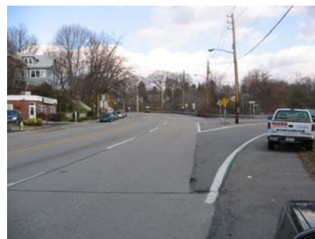
Village to own Croton Point Ave.

which are on adjacent parcels, the work can be staged so that similar types