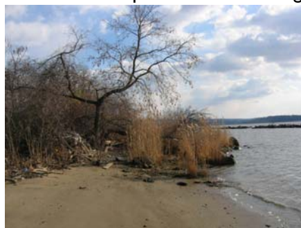
Site of proposed Riverwalk

Combining the bidding and construction of the Riverwalk plans with the Village's