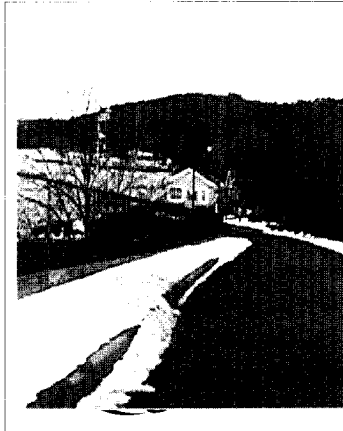
Waterfront Road location looking north from HMB Bridge

Plans for the new waterfront road are nearing completion. The design work is being done by McLaren Engineering Group of West Nyack for Metro North. The target date for 100% completion of the design is the end of March, 2003. The next step, according to Manager Herbek, is for Metro North to put the project out to bid—a 4 to 5