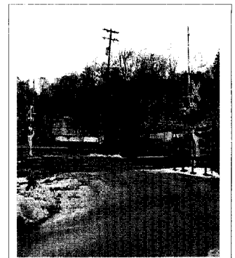
Brook Street grade crossing to be eliminated.

The new road, when completed, will provide more convenient and safer access to Senasqua and Croton Landing Parks and the Croton Yacht Club, and a reduction in the number of train whistles and train-related noises in this area.