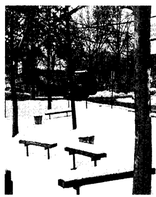
Snow covered benches at Duck Pond

The work to dredge the Duck Pond was completed in December and the Pond is now filled with water again. With this Winter's very cold weather, the possibility of skating is looming in many minds. Recreation Dept. staff check the depth of the ice regularly, which must be 6 inches by NYS Law. Green flags at the Pond will indicate that skating is permitted.