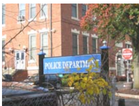
New Police Dept. Sign

During the year of 2008, many things occurred that have become part of the daily fabric of our lives but are nevertheless important to the Village.