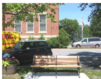
New Municipal Bldg Bench

the Croton Seniors to commemorate their 50th anniversary is enjoying a lot of use by the many people coming and going from the offices and activities at the building.