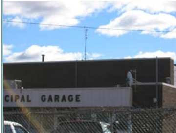
Weather Station on Roof

The decision on whether Croton's railroad station parking lot needs to be closed due to weather conditions is being aided by the recent acquisition of sophisticated weather forecasting equipment.