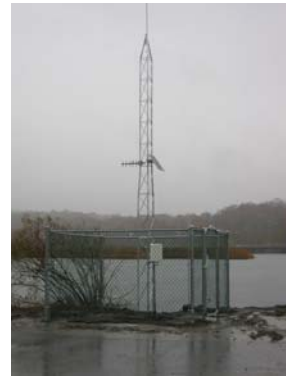
River Level Gauge

a storm is going to start and end can help in the scheduling of personnel and