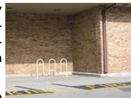
Bike rack near CVS

A new bicycle rack has joined the many new racks installed around the Village in the last year. This one, provided by the shopping center owner, is installed in the nook next to CVS. Ideally located, it does not impede pedestrian traffic, is centrally located and is sheltered from rain or snow.