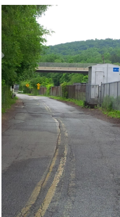
Narrow section of Elliott Way

An earlier plan to improve this narrow length of road by widening was dependent on Metro North allowing the Village to utilize