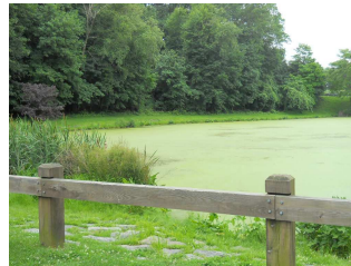
Duck Pond Before Aeration System Installed

Early July is the projected timeframe for the installation of a new aeration system in the Duck Pond. A study of the pond last year, performed under the auspices of the Ad Hoc Duck Pond Gorge Neighbors committee, found that the pond suffered from high phosphorous levels and poor circulation of water. The surface