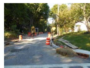
Mt. Green Road

The Grand Street Firehouse Harmon Firehouse is being evaluated for needed window replacements. Washington Engine Company will have a much needed generator installed and has repair work to drainage damage underway. The Grand Street Firehouse is undergoing repair of its apron