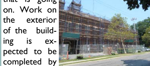
Scaffolding at Municipal Building

The most visible project is at the Municipal Building where scaffolding and netting masks the roof and brick repair that is going