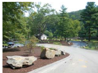
Black Rock Park

on. Work on the exterior of the building is expected to be completed by the end of the year. Inside the building, new doors will be installed on the first floor to accommodate the County's Family Court requirements regarding separation of the public from offenders and privacy concerns for witness inter-