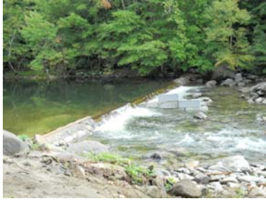
Silver Lake Dam

After a year's delay, repair work on the Silver Lake dam is underway. Although scheduled for the Fall of 2009, the work had to be postponed due to the high water flowing in the Croton River. Normally the water flow is at its lowest in late August through October but last year's rainy summer kept the water high. Work was able to commence, however, in September of this year.