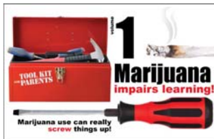
First of six Coalition Tool Kit postcards

The Croton Coalition is a member of the national Community Anti-Drug Coalition of America (CADCA) a group of over 5,000 such coalitions. CADCA has recognized the Coalition for its Tool Kit for Parents, developed by the local committee. The Tool Kit is a series of six postcards sent to parents to help them identify and talk to their children about facts of drug and alcohol use. The first in the series is shown below.