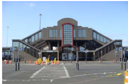
Station to Undergo Improvements

Among the planned improvements are upgraded customer bathrooms, all new air conditioning, a new ticket office and concession stand, new stair portals to the tracks and new signage throughout. All the walls and ceilings will be replaced or retrofit with new materials and hardware. The entire station will be freshly painted and new LED lighting will be installed throughout. Metro North is