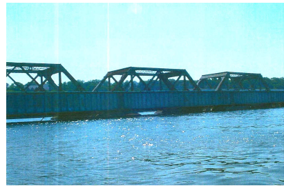
1907 Trestle Bridge

The railroad trestle bridge across the mouth of the Croton River is in need of repair. Metro North has notified the Village that it will begin repairs to the bridge later this spring. At a work session on February 25, MN representatives and their engineering consultants met with the Board to outline the work to be done. As important as the construction itself, MN also addressed the precautions and protections they are taking for aquatic vegetation and to reduce any recreational impacts on boaters launching from the Village's Echo Boat Launch site. A