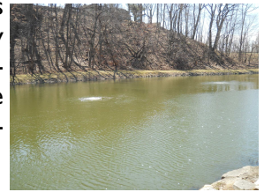
Early April at the Pond

A visitor to the Duck Pond will notice a slight bubbling in several areas of the pond. That is the effect of the underwater aeration system that was installed to counteract the heavy algae outbreaks which were covering the pond with a green slime every summer for the past several years.