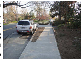
New sidewalk and intersection.

As shown in the pictures, the sidewalk and curbing has been realigned to make a smoother transition at