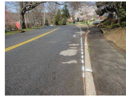
Before realignment and new concrete sidewalk.

Work on the sidewalk replacement along the south side of Cleveland Drive between the Croton Library and Hughes St. has been completed. The new sidewalk and curbing replaces a deteriorated asphalt sidewalk.