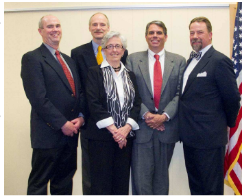
Board of Trustees

Village government in Croton has been of the Council/Manager form since 1971 when it was formally adopted. Under this form of government, the job of governing is balanced between a professional manager and an elected council made up of the Mayor and four Trustees. According to the International City/Council Management Association (ICMA), the Council/Manager form of government is the most popular form of government in communities of 5,000 or more. The Council in Croton is the Board of Trustees.