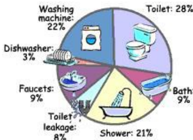
Average water use in the home:

The Village Water Dept. personnel are always available to review your individual circumstances with you if you have questions about your water bill. They can be reached at 862-1419. during business hours.