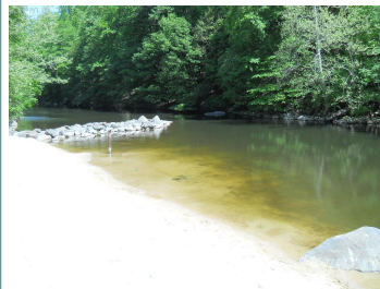
Silver Lake Beach

Beginning Memorial Day weekend, on Sat., May 24, Silver Lake will be open for swimming from 11 am to 7 pm on weekends only . On Friday, June 27, Silver Lake Park will be open daily from 11 am to 7:30 pm. Due to weather conditions and staffing, the dates and times are subject to change. It is anticipated that the Park will remain open for swimming until on or before , Monday, September 1.