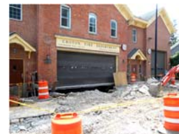
Grand St. Firehouse