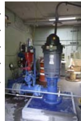
Well #3 Pump