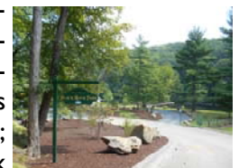
Black Rock Park