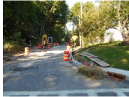
Mt. Green Road

September - The Village is awarded two electric vehicle charging stations from NYPA. Con Ed performs extensive