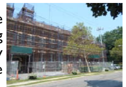
Exterior renovations at Municipal Building

undergoes landscaping and parking renovations. Nordica Pump Station planned Phase 2 upgrades designed. Continued on Page 3