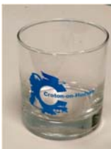
Croton Logo glass

The Croton Historical Society also has a variety of items that make good gifts. A woven tapestry-like coverlet depicting scenes in Croton is available in red, blue or green stitching at $50; perfect to display