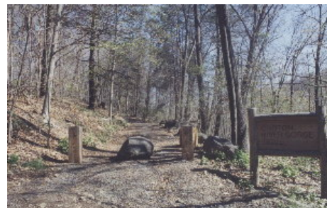
Croton Gorge Trailhead

There are also several very noteworthy wooded sections of the trail system. For details on these trails, you can obtain a Trails Map in the Village Office and online. The Croton Gorge Trail takes you to the Dam in one direction and Ossining in the other. The North Highland Place Loop Trails can take you to either the Upper Village area or to the Hudson River via Brook St. to the pedestrian bridge to Croton Landing and Senasqua Parks. The Highland Trail begins in the Arboretum and goes around Hudson National Golf Course, connecting with the Brinton Brook Sanctuary. The Croton Riverwalk Trail